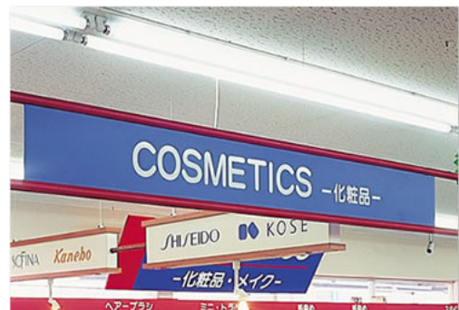
POP indoor sign with AL-LEADER